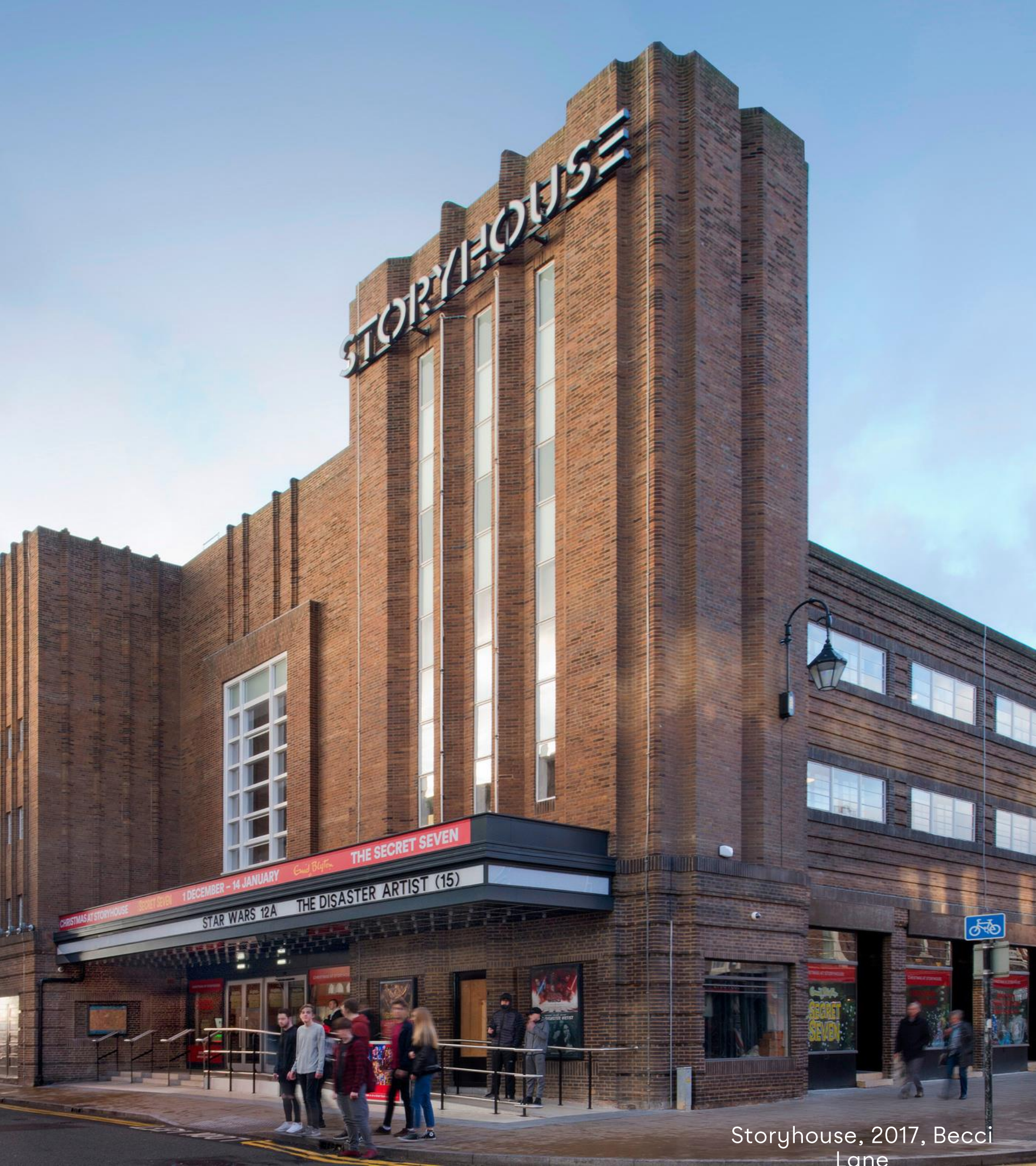
Storyhouse, 2017, Becci Lane