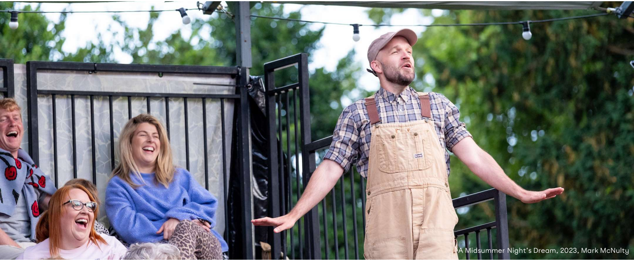
A Midsummer Night's Dream, 2023