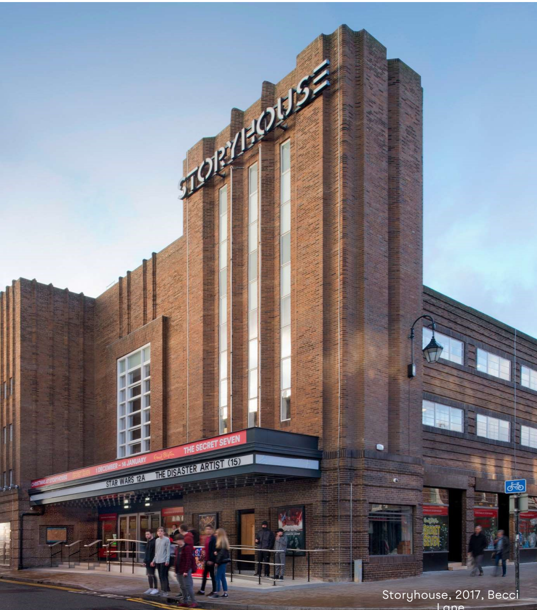
Storyhouse, 2017, Becci Lane