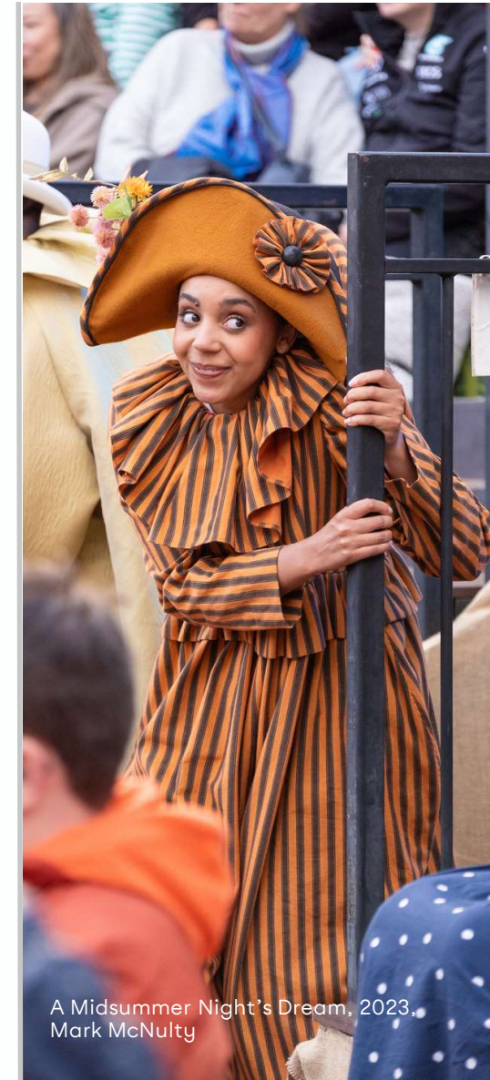
A Midsummer Night's Dream, 2023

Diverse perspectives solve the hardest problems and make the best decisions. So we seek them out, and invite them in.