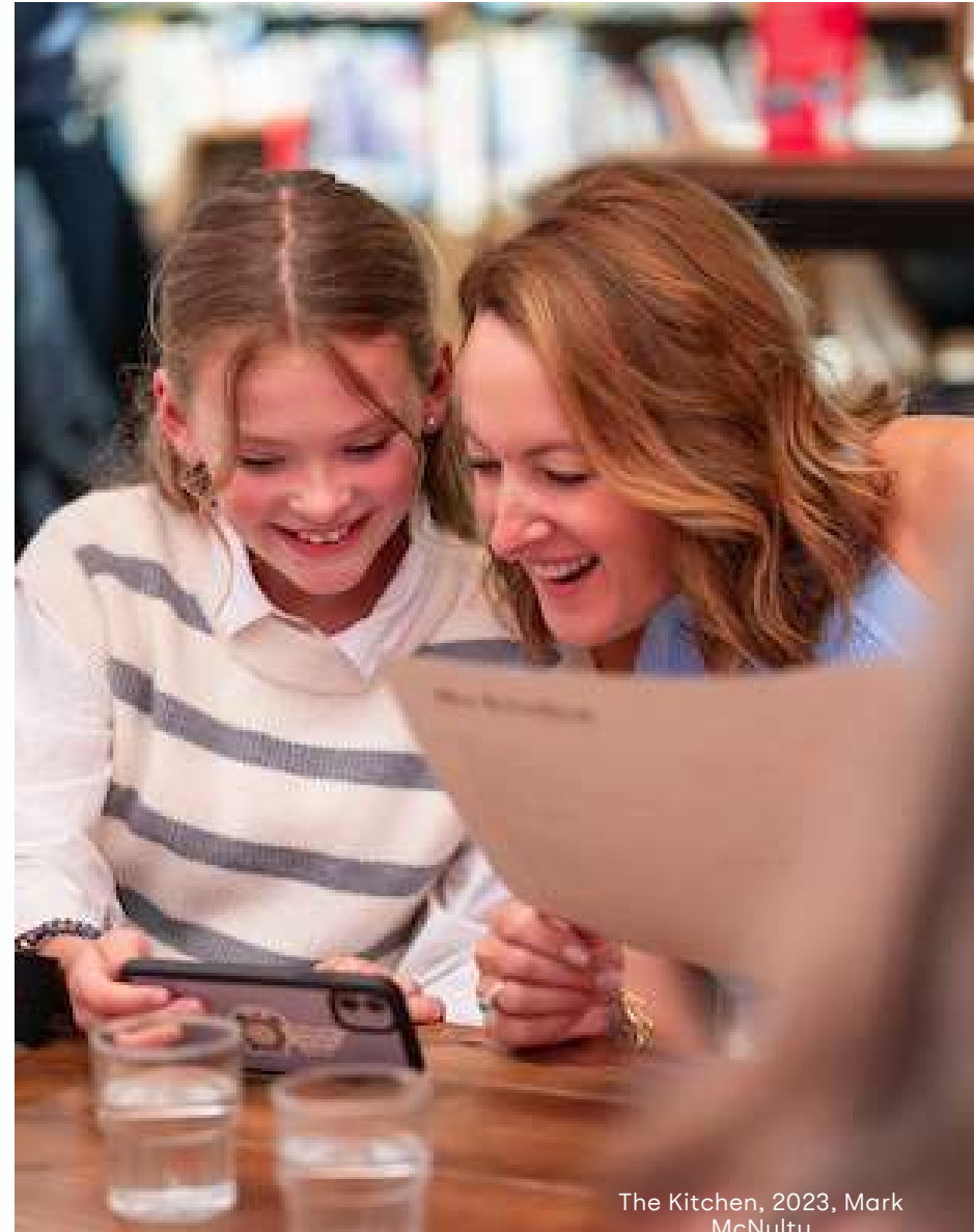
The Kitchen, 2023, Mark McNulty

We are looking for staff who are available to work a mixture of weekdays and during the weekend. The building is open from 8am - 11pm daily, so unsociable hours are common with this role, and flexibility is a requirement. All applicants are required to work weekends and evenings.