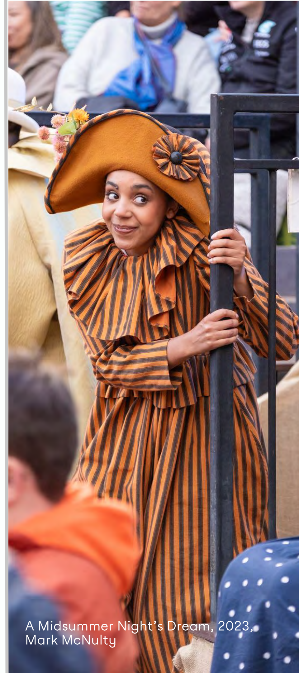
A Midsummer Night's Dream, 2023

Diverse perspectives solve the hardest problems and make the best decisions. So we seek them out, and invite them in.