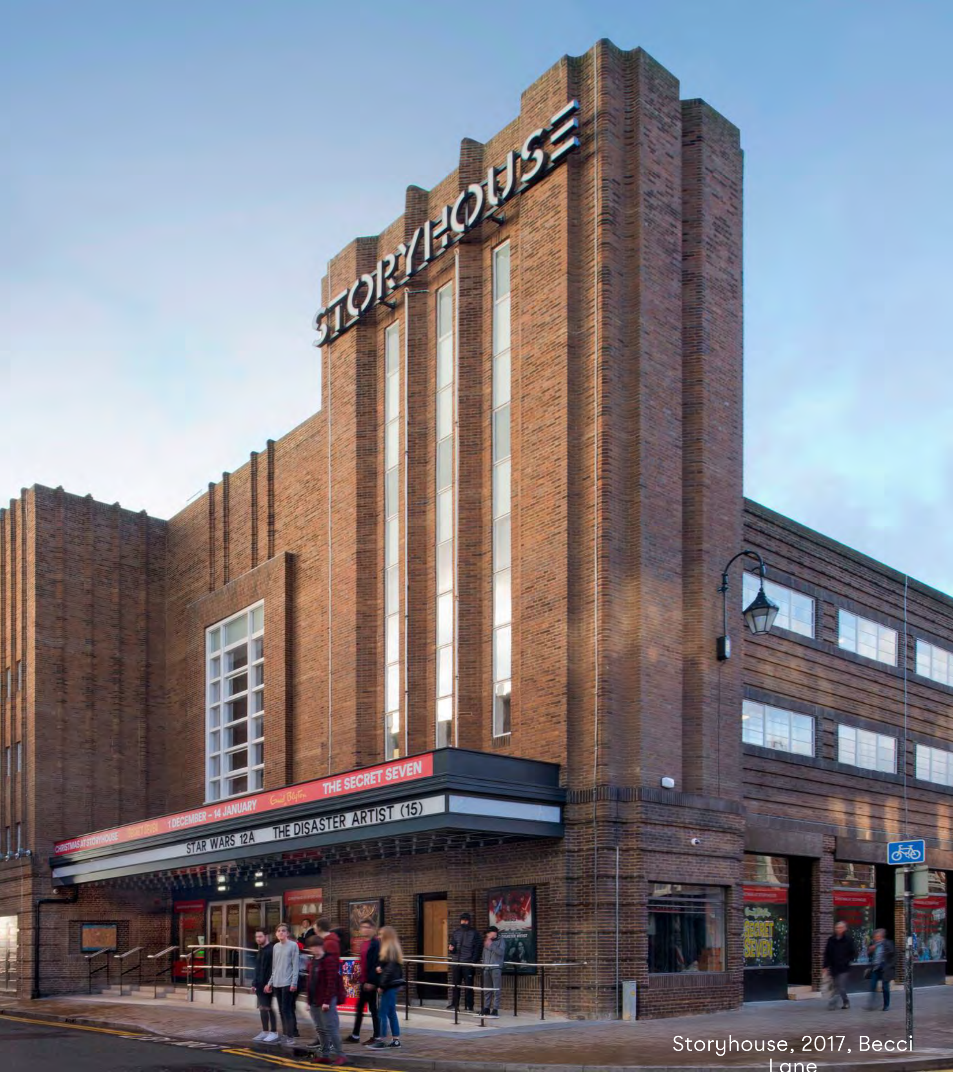
Storyhouse, 2017, Becci Lane