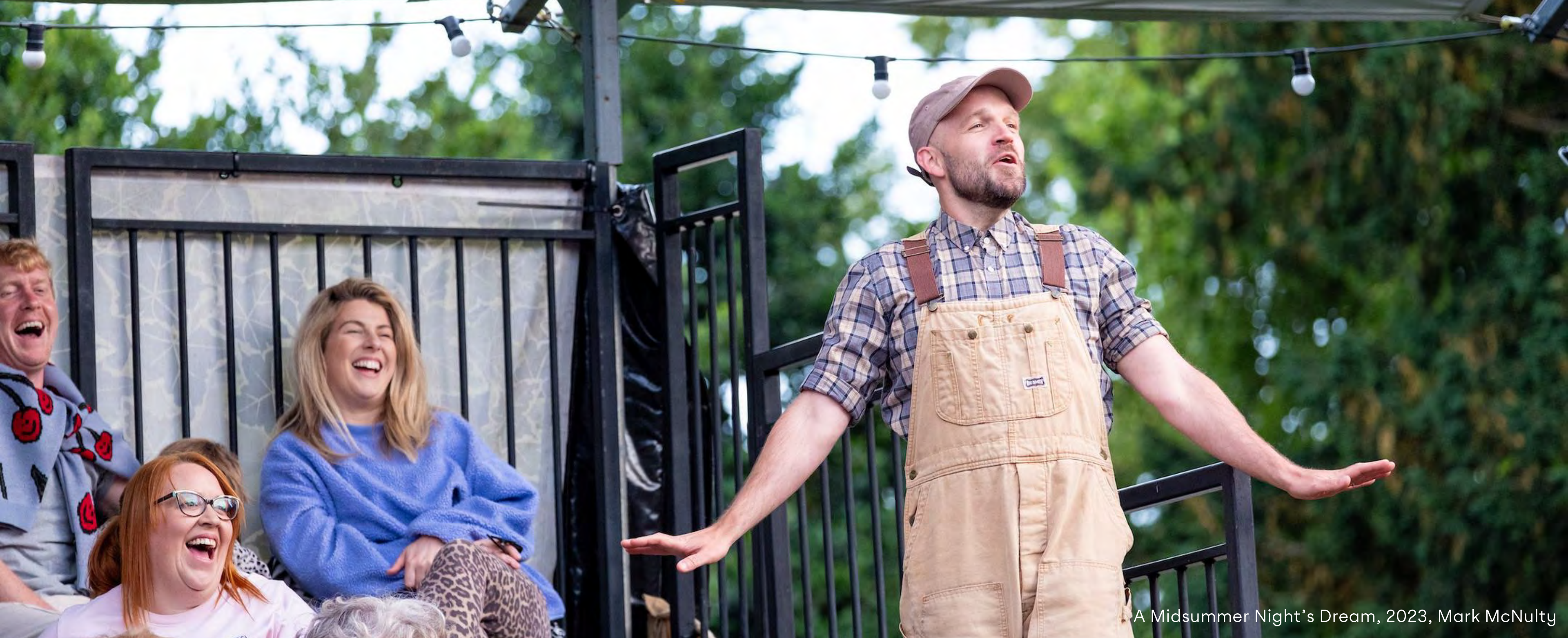
A Midsummer Night's Dream, 2023