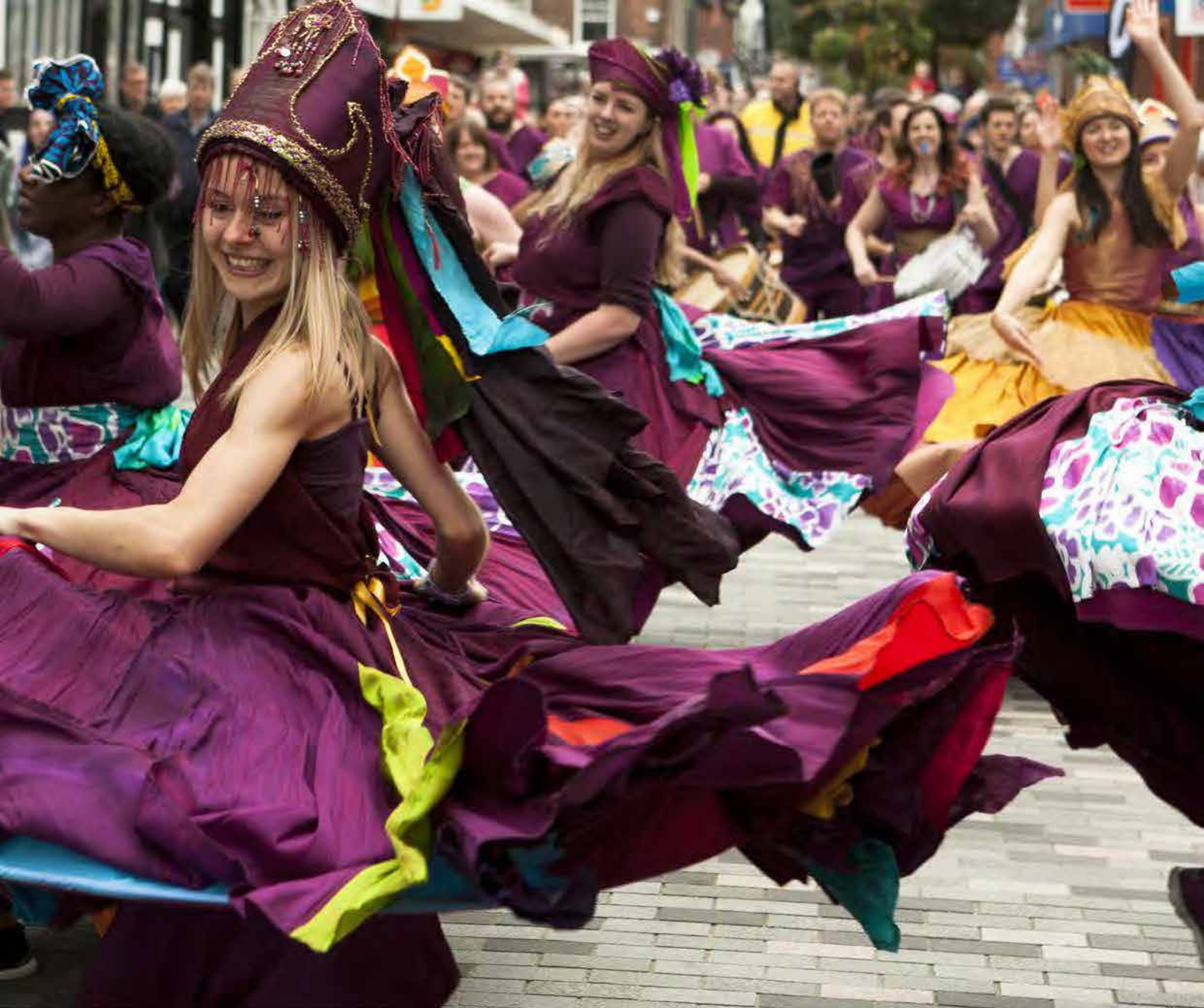
Now Northwich Festival 2019, Cheshire Dance, Juba do Leão and Movema.