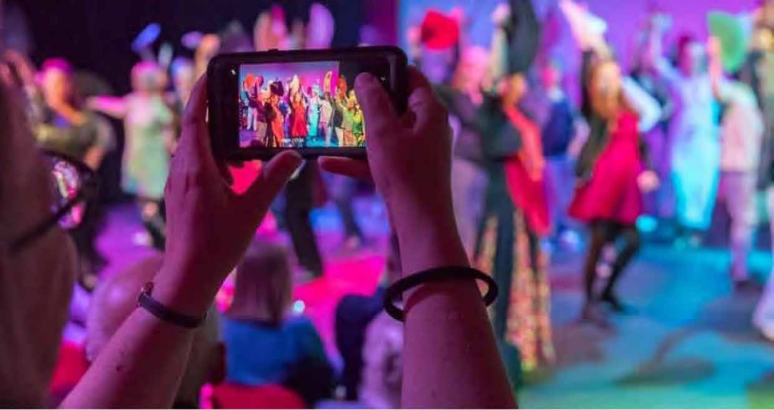
Cheshire West Community and Voluntary Arts Awards 2022.

The West Cheshire Culture Partnership is looking for new members. Could you be one of them?